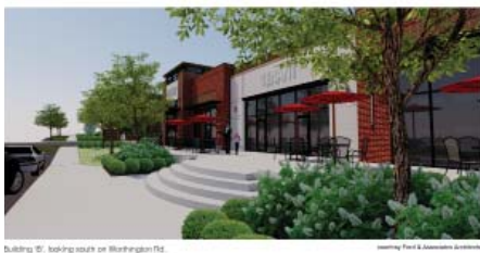
Building G, looking south on Worthington Rd. Courtesy: Paul & Associates Architects

NP Limited (the developers of Polaris in Columbus) purchased approximately 100 acres in 2004 to expand their land holdings further east of interstate 71. The site was split by the extension of Polaris Parkway to State Street in Westerville in 1998. The site was further divided with the extension of Worthington Road to County Line road in 2015. The site plan was challenging because although we had over 700 lineal feet of frontage on Polaris Parkway, the City of Westerville wanted the buildings to front on the new extension of Worthington Road. The site plan is anchored by a Fresh Thyme grocery store, and the developer is finding that the market for restaurants and upscale retailers is good. The project is designed to accommodate and encourage pedestrian walkability, and will relate strongly to the new apartments to the south.