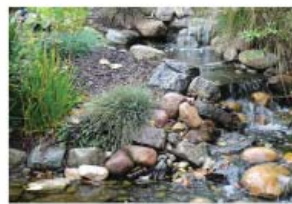
EXAMPLE - NATURAL STREAM BED NTS