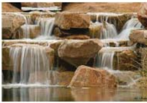
EXAMPLE - FLAT STONE STEP WATERFALL NTS