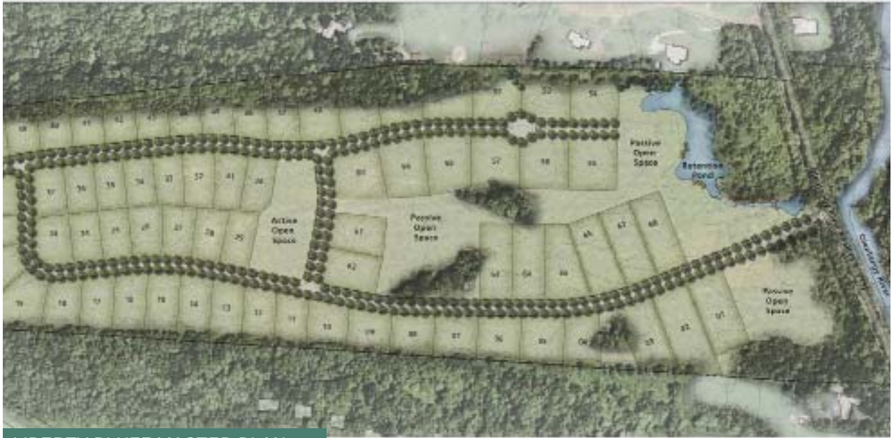
LIBERTY BLUFF MASTER PLAN

Liberty Bluff is a conservation subdivision located just south of Hyatts Road off State Route 315 in northern Liberty Township. The Olentangy River and State Route 315 are both designated as Scenic Byways/Rivers. The plan preserves the river corridor with large setbacks and open space reserves that preserve most of the natural tree stands adjacent to SR 315.